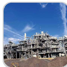
factories and mines