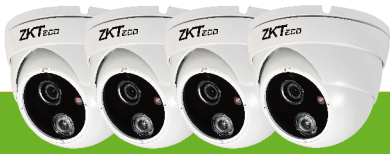
ZKMD532 Megapixel CMOS IR Dome IP camera